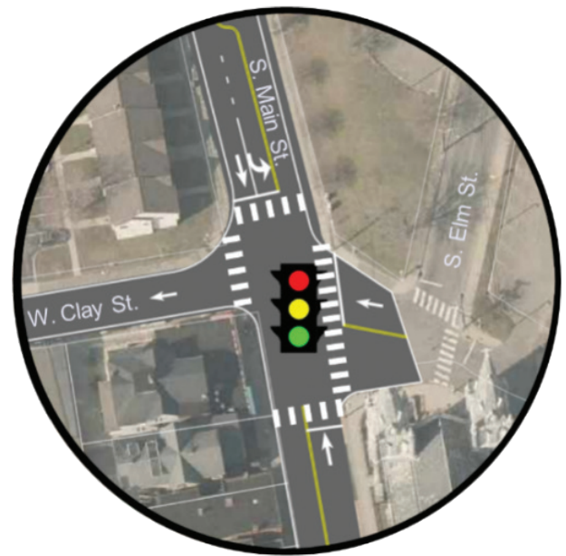
Sample intersection improvement